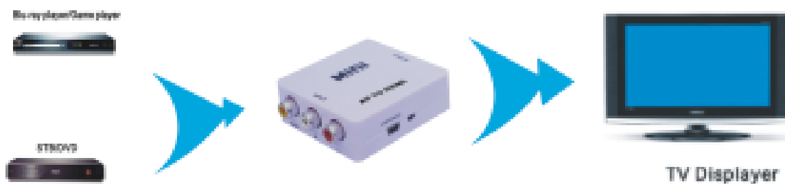
AV TO HDMI CONVERTER